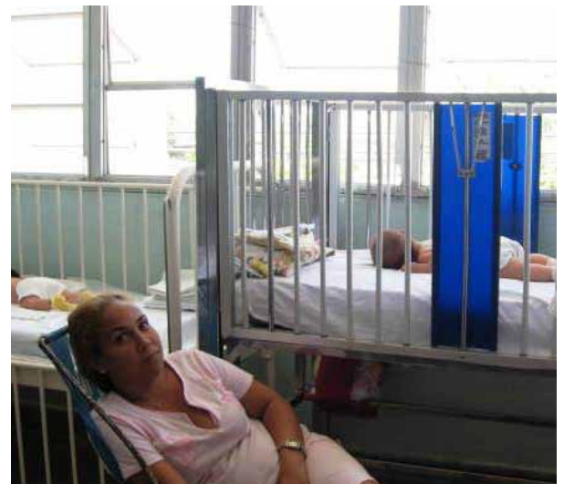
Conditions at Hospital Raymundo Castro improved after receiving a donation from Global Links.