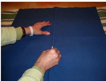
Step 5 (a)