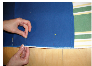
Step 5 (c)