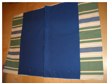
Step 5 (b)